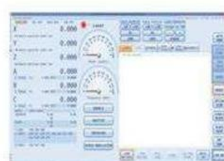
User-Configurable CNC Interface